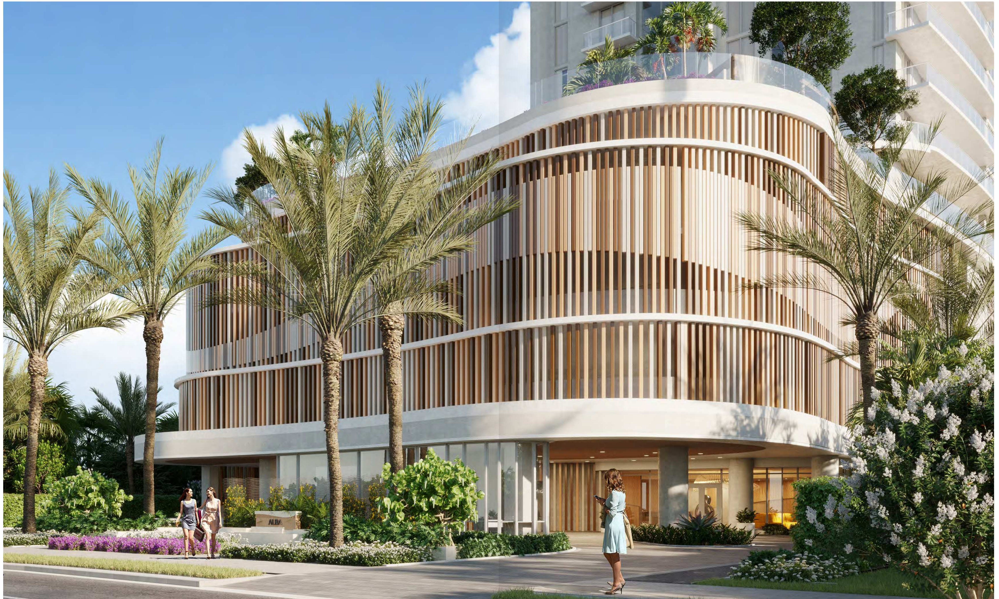
Arrival and porte cochere entrance