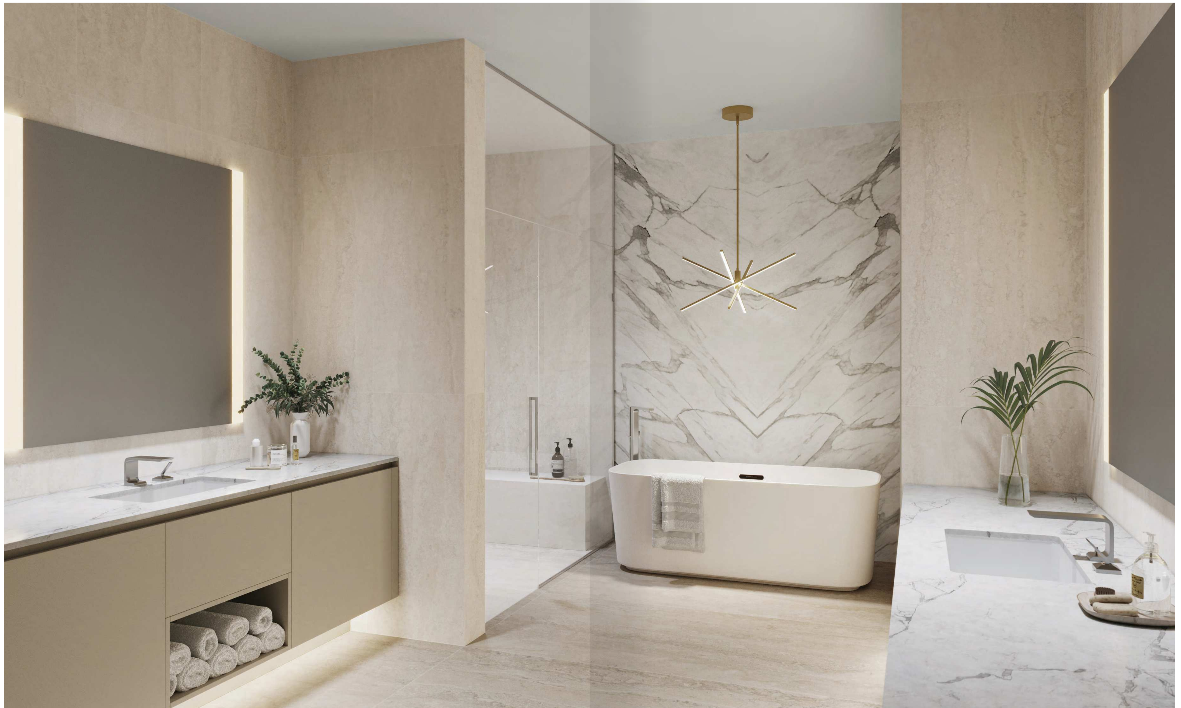
Oversized primary bathrooms with large soaking tub, frameless glass shower, private toilet room and double vanities