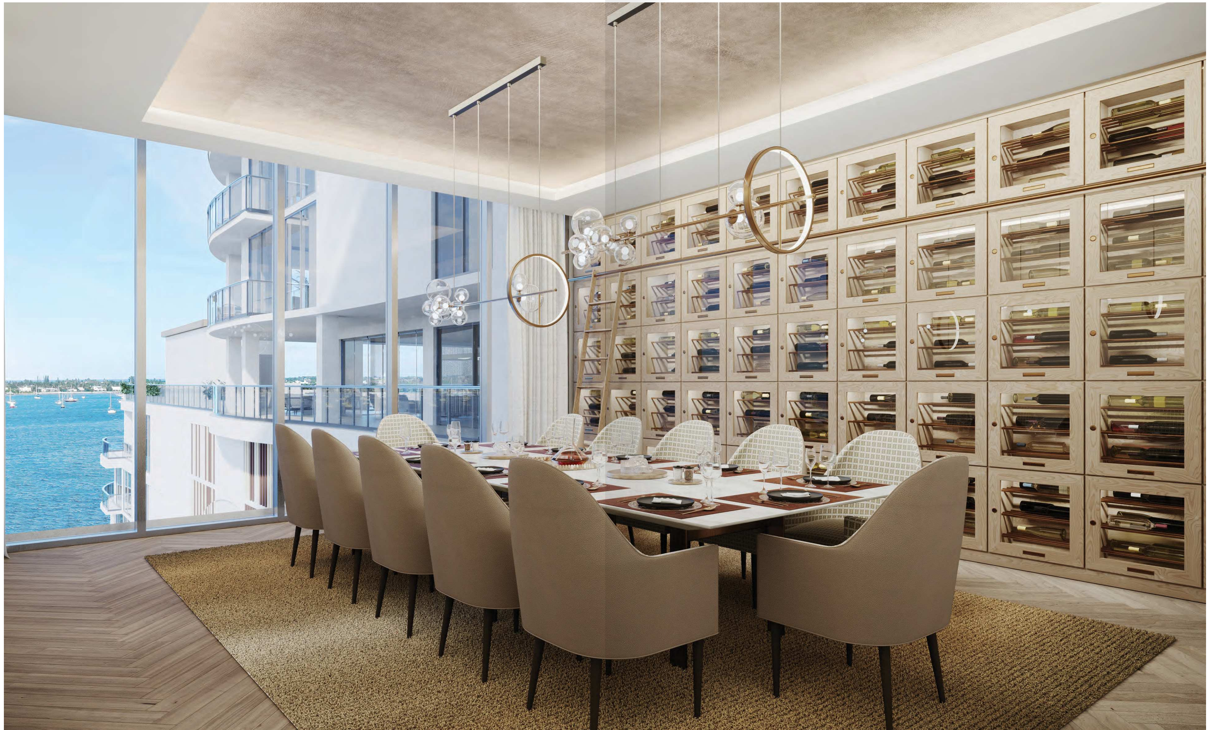
Private dining room and wine lockers