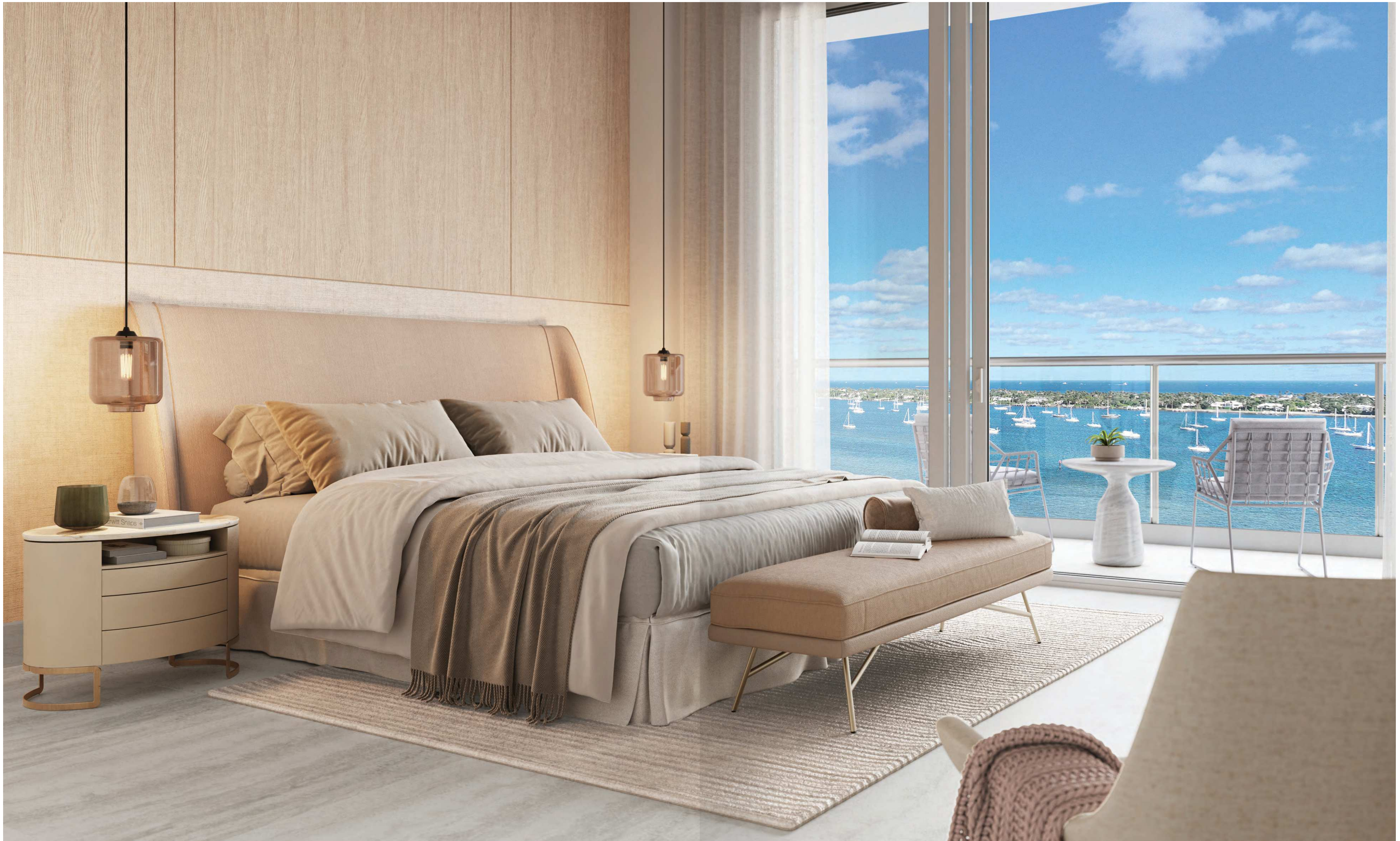
Expansive primary suites with endless views of the Atlantic Ocean and beyond