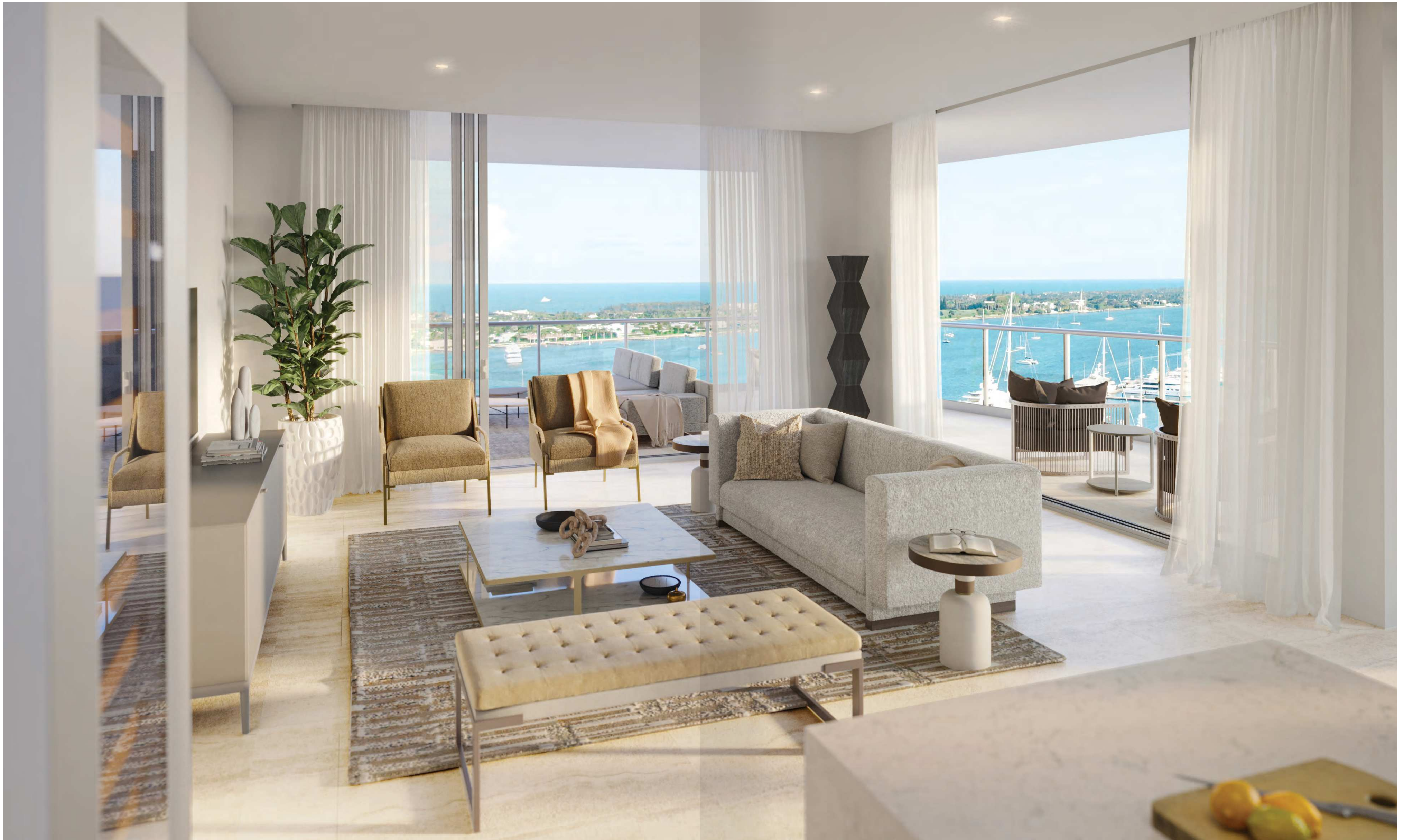
Residence Great Room with floor-to-ceiling sliding doors