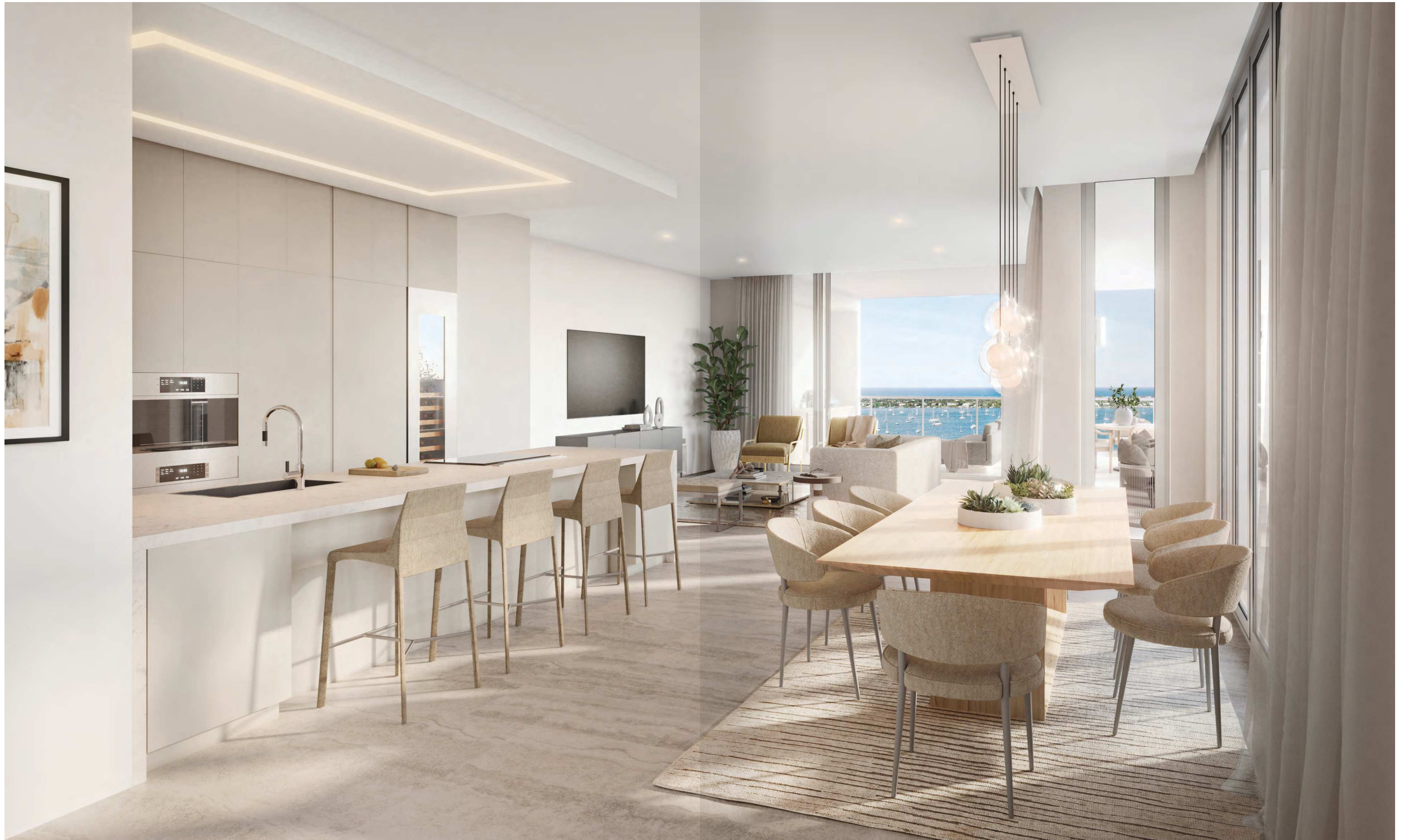
Italkraft kitchens featuring imported quartz countertops and SubZero® and Wolf® appliances