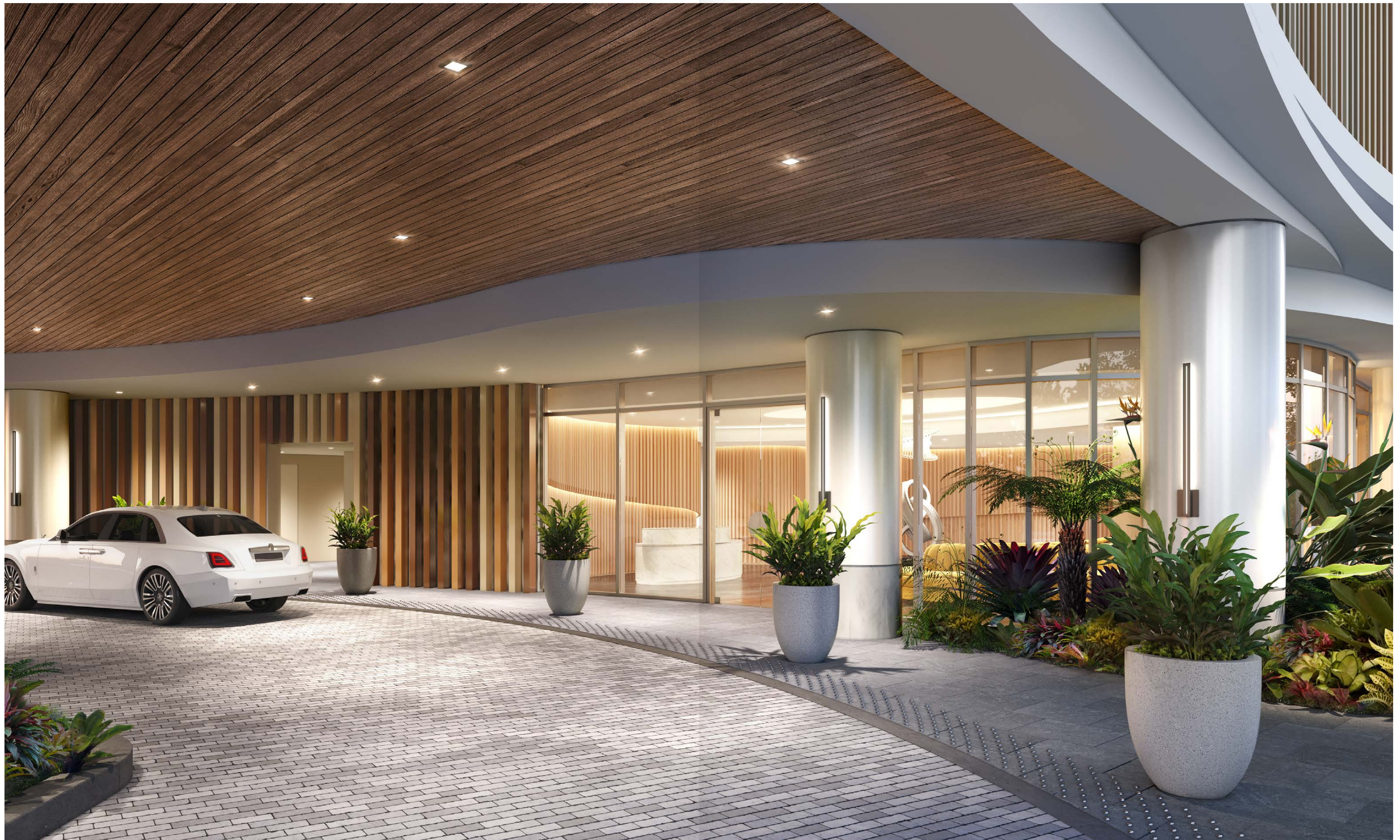
Private and secure arrival experience